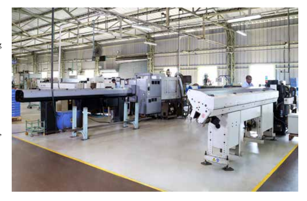
Top: The Precision Components Division, Aurangabad Bottom: The Foundry Division, Aurangabad

For all these, Birla Precision has three plants in Aurangabad, one in Nashik and a fifth one that is coming