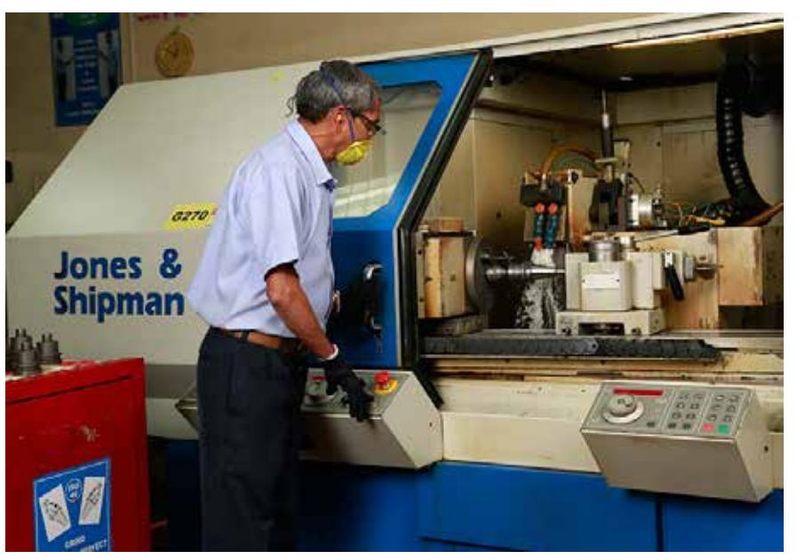
Top: The Casting Machining Division, Augangabad Left: The Tool Holder Division, Aurangabad Bottom: Engine parts from BPTL's Automotive Division